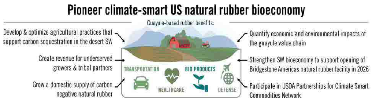
Figure 1: Beneficial outcomes of our climate-smart domestic natural rubber production project

Guayule is an alternative source for the commodity, producing equivalent natural rubber to Hevea . Guayule offers the opportunity to create a new domestic industry, based on climate-smart