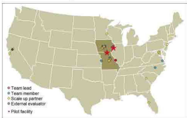
Figure 2. Horizon II partners (dots), pilot facilities (stars), and focal region for the period of the USDA grant (dark tan). By 2040, the new climate-smart system is expected to extend nationwide.

The proposed climate-smart production can be seamlessly integrated into current practices and will neither disrupt markets nor interfere with safe and secure food supply goals .