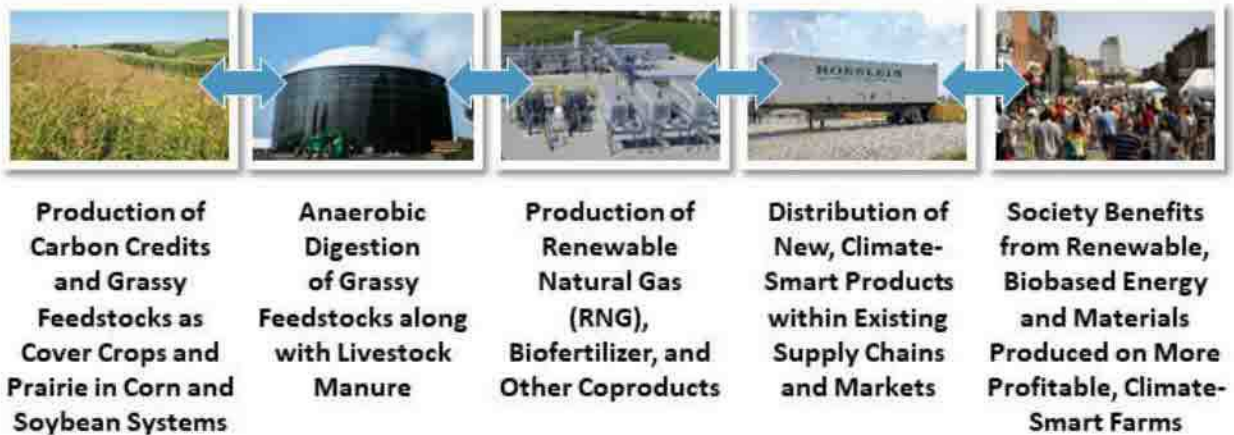
Figure 1. The climate-smart system developed through the Horizon II pilot project.

We propose to pilot a new climate-smart system for US agriculture and lay the foundation for rapid scale up. The program will reduce greenhouse gas (GHG) emissions and improve carbon sequestration for corn, soybean, pork, and beef commodities by 250 million metric tons CO 2 e per year. This impact is equivalent to displacing diesel fuel consumption by 20.7 billion gallons annually. The program will verify on a large scale that prairie grasses and cover crops are economically viable, low-CO 2 e commodities that provide a stable income stream to farmers by being integral to agriculturally based carbon credits and renewable energy production (Fig. 1).