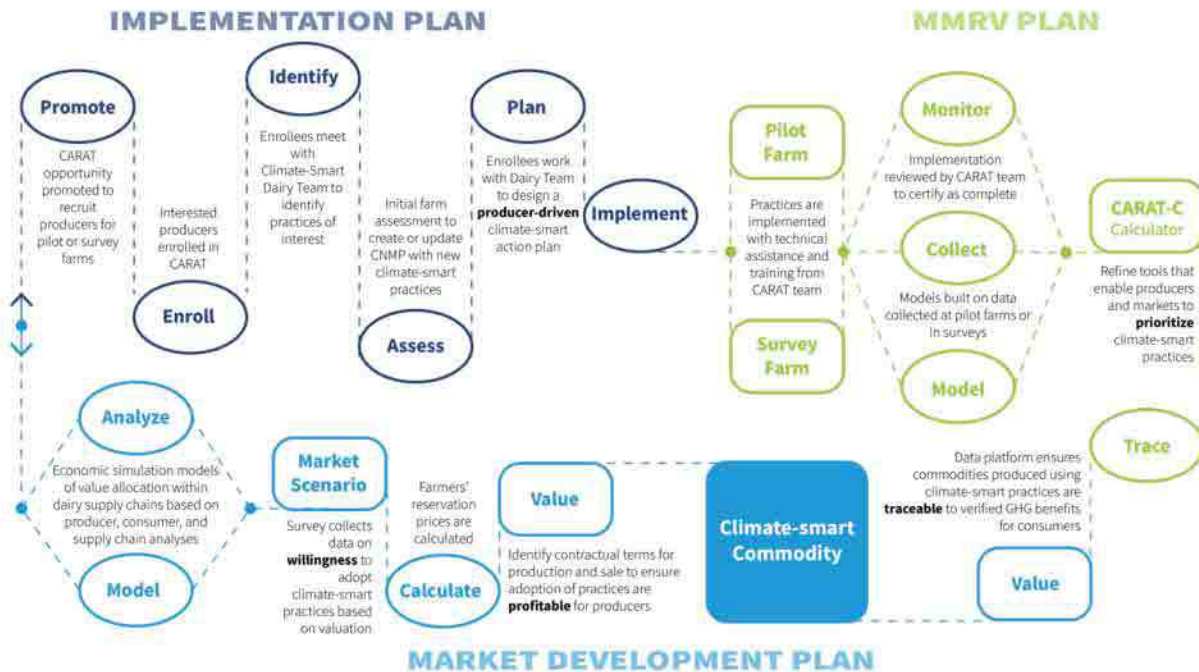
Figure 3. Schematics of the flow of the project, from left to right, highlighting the implementation plan on the ground, the MMRV plan, and the market development plan.

Penn State SAFES will be the lead organization, administering subawards to CDE and PDMP and other services. The SAFES-AEC has over a decade of experience developing implementation partnerships to provide technical and financial assistance to farmers in adopting conservation practices for soil and water quality improvements, primarily funded by National Fish and Wildlife Foundation’s Chesapeake Bay Stewardship Fund. This public/private partnership will be the model for implementation of this program. CDE, PDMP, and RBC will work with AEC and Penn State Extension to collaboratively establish criteria for producers to participate in CARAT, to ensure representation of Pennsylvania’s dairy industry as well as identify climate-smart practices that should be considered for implementation. RBC has invaluable experience in monetizing ecosystem services for farmers, specifically trading nutrient credits. Proagricra brings experience in big data traceability and operation in global markets.