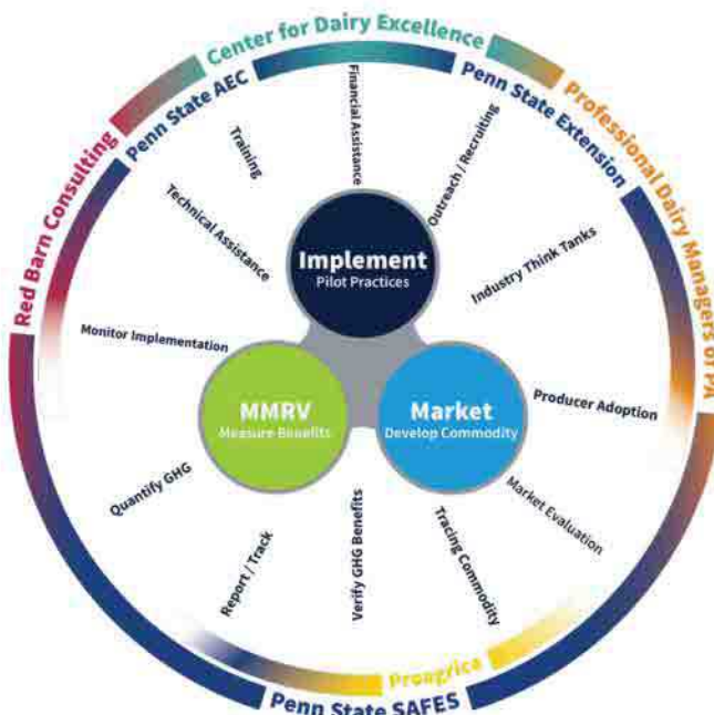
Figure 1. Partnership structure and function diagram.

Proagrica is a global provider of independent connectivity and data-driven support solutions for the agriculture and animal health industries. Proagrica will advance the market development