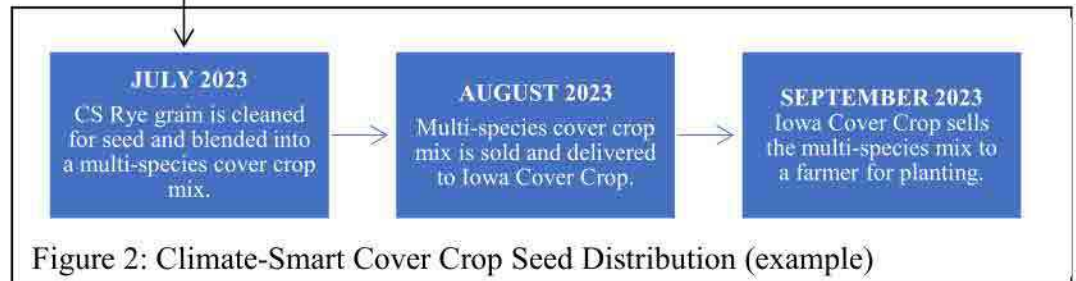
Figure 2: Climate-Smart Cover Crop Seed Distribution (example)